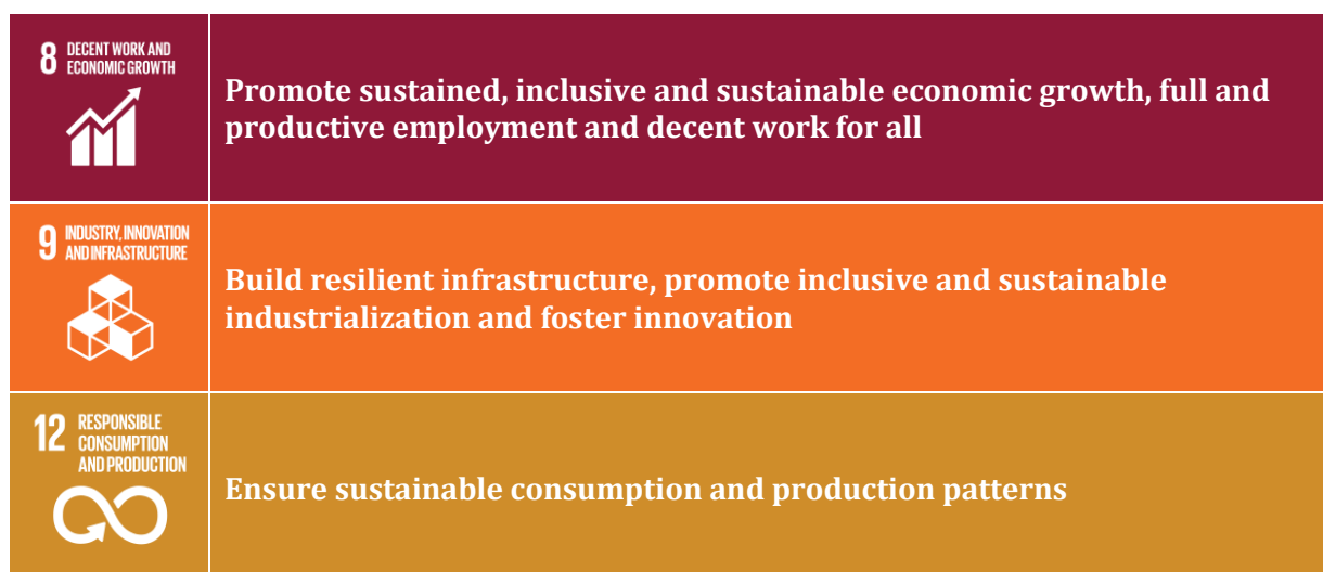
Figure 4: SDGs of most relevance to NQIP

4.1.6 The work was also relevant to and well aligned with the Sustainable Development Goals (SDGs). In the long-term – and assuming NQIP’s results can be sustained – the work has the potential to contribute most directly to SDG 8 (decent work and economic growth), SDG 9 (industry, innovation and infrastructure) and SDG 12 (responsible consumption and production). The most relevant SDGs are elaborated in figure 4: